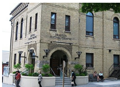
The Drayton Festival Theatre is a renovated 1902 opera house and former town hall.

"They offer guests great variety and terrific entertainment value, whether they want to see a smaller, more-intimate production or something on a much grander scale," he added.