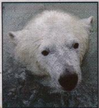
MEET THE LOCALS On a Canadian vacation

This week's reader photos theme is your favourite Canadian destination. Whether you travelled far across this great country of ours or enjoyed a "staycation," close to home, we want to see photos of your Canadian vacation. To share your photographs with Sun readers, upload them to our site: